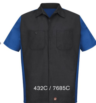
CHARCOAL / ROYAL BLUE