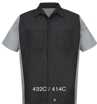
CHARCOAL / GREY

Textile fabric colours are subject to dye lot variation and will not be exact match to print pantone reference