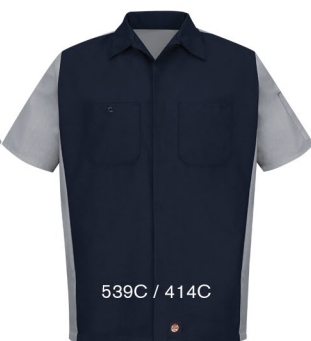
NAVY / GREY