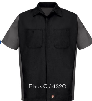
BLACK / CHARCOAL