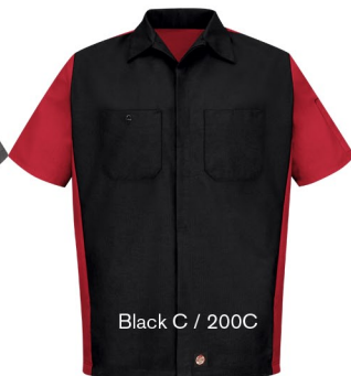
BLACK / RED