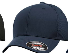
Between 534C & 533C / Between 534C & 533C