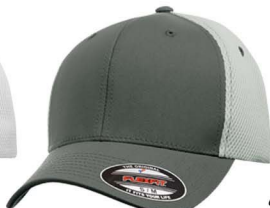
Little Darker Than 7540C / Little Lighter Than 427C