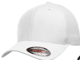
No PMS / No PMS