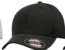
Black C / Black C