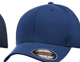
654C / 654C