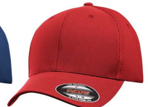
1935C / 1935C