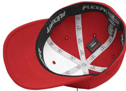
ATC™ taping on inside seams