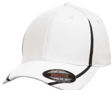
No PMS / Black C