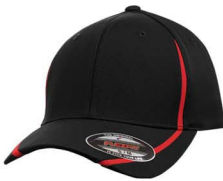
Black C / 186C