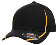
Black C / 7549C