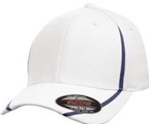
No PMS / Little Lighter Than 289C