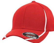
186C / No PMS