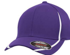
7671C / No PMS