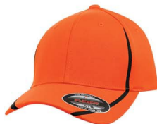
1665C / Black C