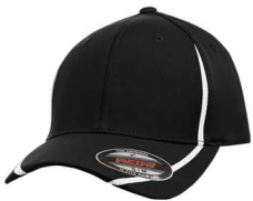
Black C / No PMS