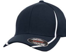
Little Lighter Than 289C / No PMS