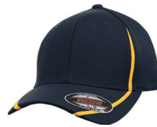
Little Lighter Than 289C / 7549C