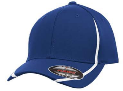
7685C / No PMS