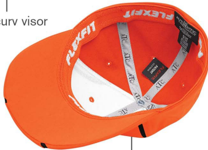
ATC™ taping on inside seams