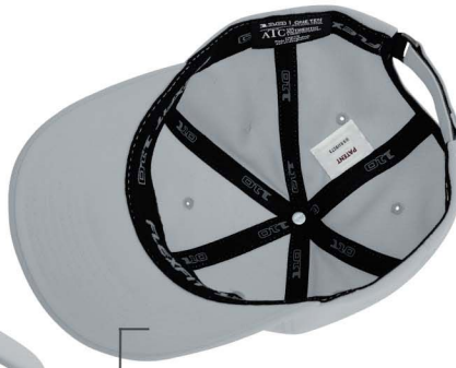
Matching under visor