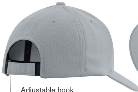
Adjustable hook and loop closure