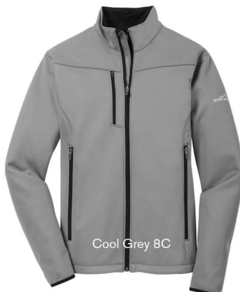
Cool Grey 8C